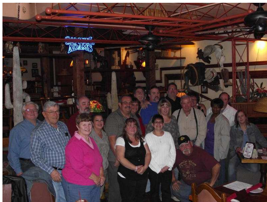
Awards presented at the November meeting